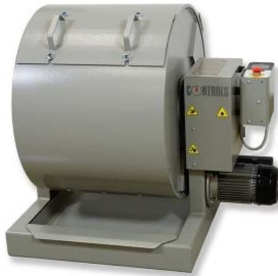
Los Angeles Abrasion Machine (Controls)