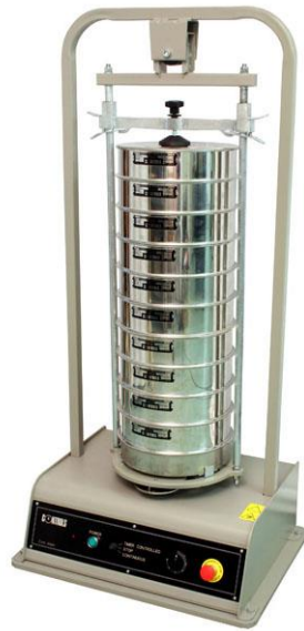
Sieves with Sieve Shaker (Controls)