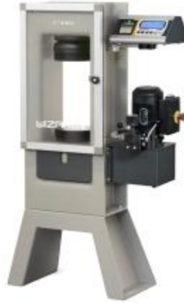
Compression Testing Machine (500 kN and 1000 kN) (Controls)