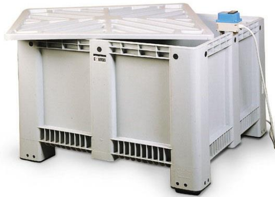
Curing Tank (Controls)