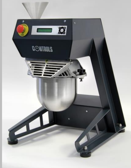
Digital Mortar Mixer (Controls)