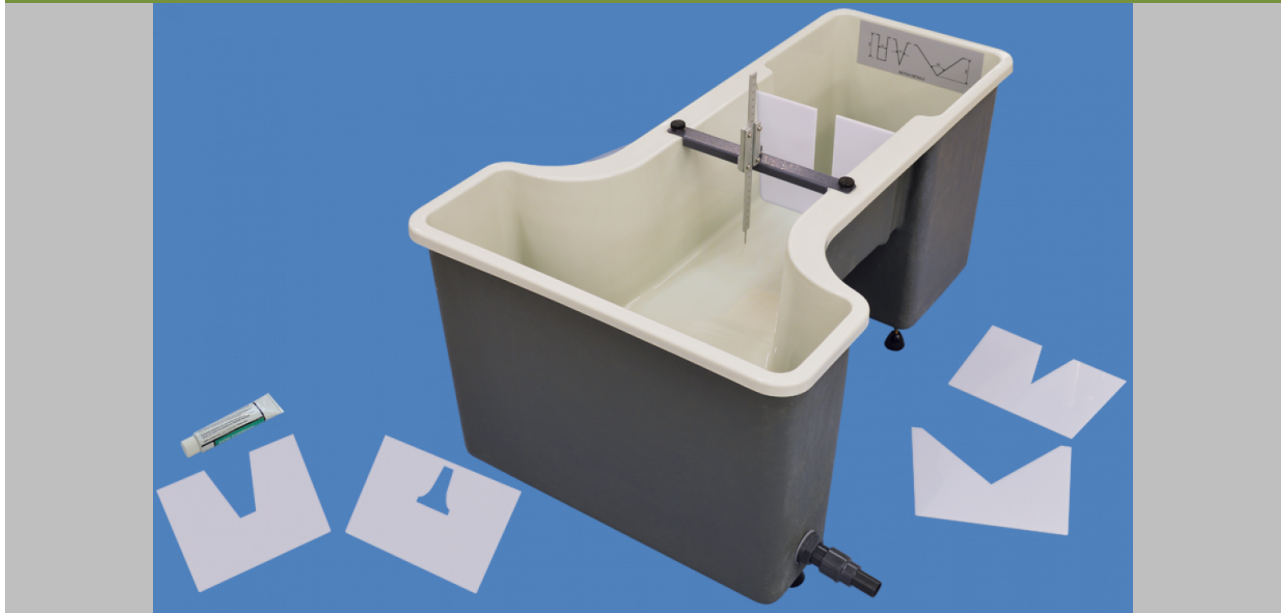
Discharge over a notch (TecQuipment)