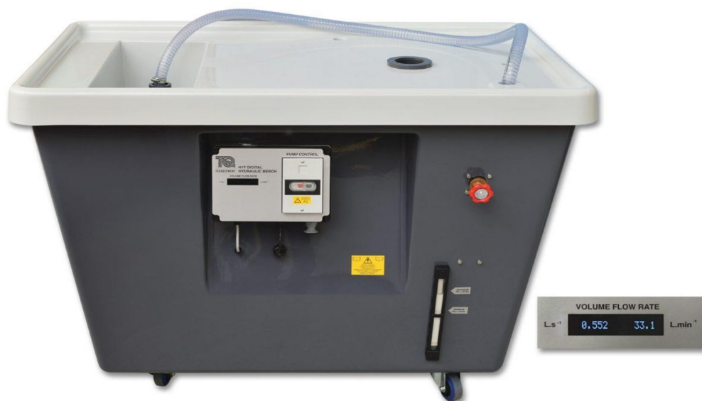
Hydraulic Bench (TecQuipment)