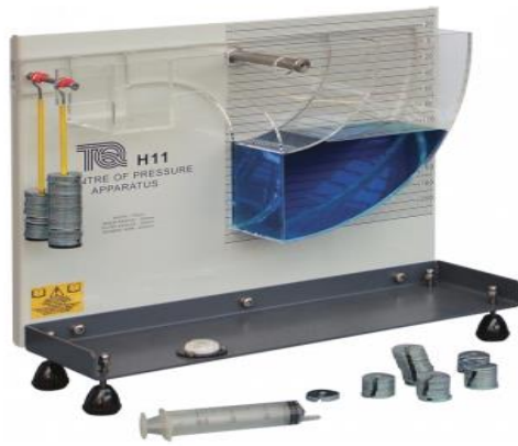
Center of pressure(TecQuipment)