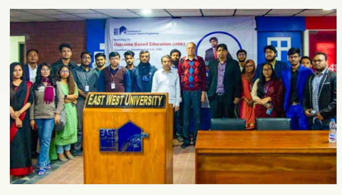
Department of Computer Science & Engineering (CSE) at East West University (EWU) recently