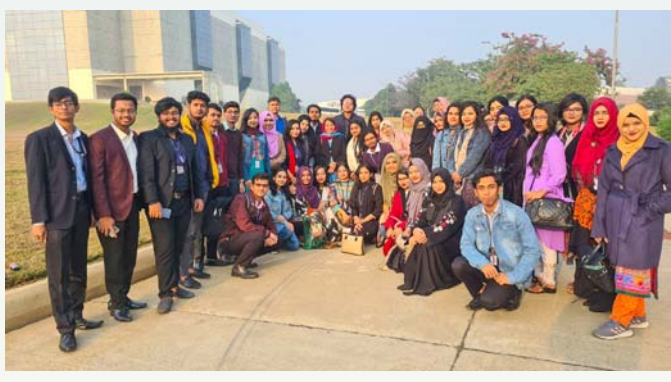
Visit to Square Pharmaceuticals Ltd.

Students of 7th semester of Department of Pharmacy, East West University visited Square Pharmaceuticals Ltd. in Kaliakair on 8th January 2023.