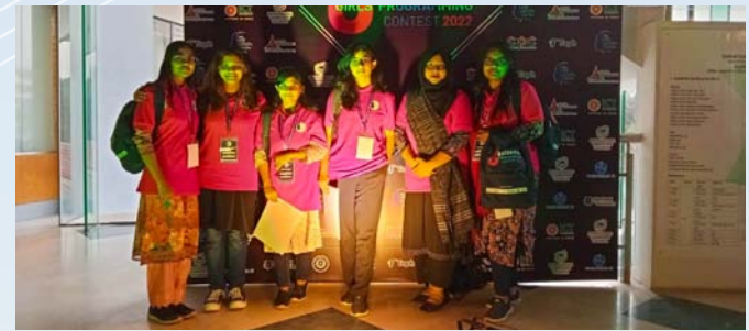
The 2022 ICPC Asia Dhaka Regional Site Contest