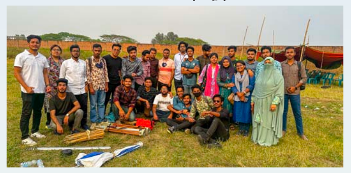
Field Survey of Civil Engineering Department Spring 2023

Department of Civil Engineering, East West University organized a field survey on March 22, 2023 for the Civil Engineering students enrolled in the "Surveying and Introduction to GIS" course (CE103) in Vadam, Ashulia. Along with the students, one faculty member and three lab officers participated and supervised the field survey. The students performed practical surveying tasks throughout this field survey, and these experiences are expected to help the students understand the real-life surveying problems.