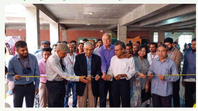
Inauguration of "Project Showcasing and Job Fair"

A Daylong "Project Showcasing and Job Fair"